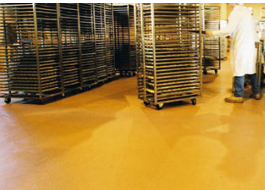
Food & Beverage Industry